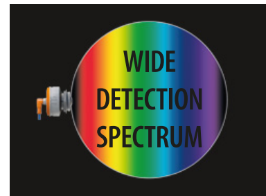
Detects all kind of ignition sources

Full 180 degree field of view. One single spark detector can detect the whole cross sectional area of the duct.